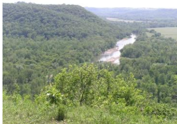
Zumbro River view