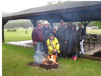
Saturday evening potluck