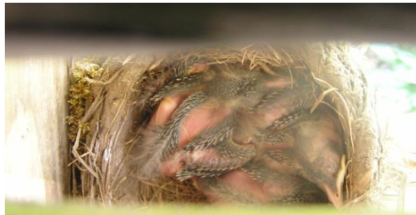
Sleeping baby robins

That's a sweet story, along with our pair of ducks, wild turkey nest across the creek and family of bunnies under the front bushes. But a more exciting visitor showed up a week ago. He appeared sunning himself on the back driveway - Mr. Snapping Turtle - better than a foot across the back of his shell. When I neared to take a photo he pulled himself inside his shell. No problem. The next day I found him under the gate to the horse's dry lot. He didn't seem to mind them sniffing his shell and again pulled himself inside. Hmm, much more shy than I thought. A day later he was getting even more friendly and I almost stepped on him inside one of the horse stalls! OK, I'm thinking of what to do and how to get him out of there now. Another sniff from Mikki and she goes out the door. Chance spots him on his way outside and takes another sniff. Then - - Chance explodes, knocking into the walls and blasting out the door! His muzzle is bleeding so looks like he got a little too close to Mr. Turtle. Being the Mother Mare that I am I was immediately outraged - he has now outlived his welcome here. Taking the long-handled shovel I scooped underneath him and literally threw him out the barn door. Again and again . . . Onto his back, now flipping back over. I managed to get him a ways down the hill and out into pasture grass. And we haven't seen him since. Chance is fine, just a minor bite that I cleaned and medicated. But I can just imagine if that turtle hadn't let go . . .