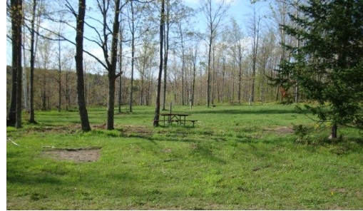
Everyone else's campsites