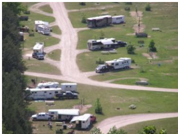
Campground view from bluff

There was a great turnout for the weekend at Zumbro Bottoms. Several members came on Thursday to ride the trails. It was great riding Thursday and Friday. We got to try out the new bridge which is quite high up over the river compared to the old one. There are large metal barriers at the bridge entrances that the horses must go through, but an ATV wouldn't be able to. Most of the horses were pretty wary, but once they went through and didn't get "eaten up", all was well.