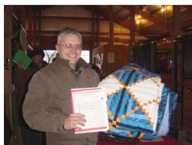
The kids loved the pony rides, everyone loved the baked goods sale, & the high bidder on the quilt was pleased!