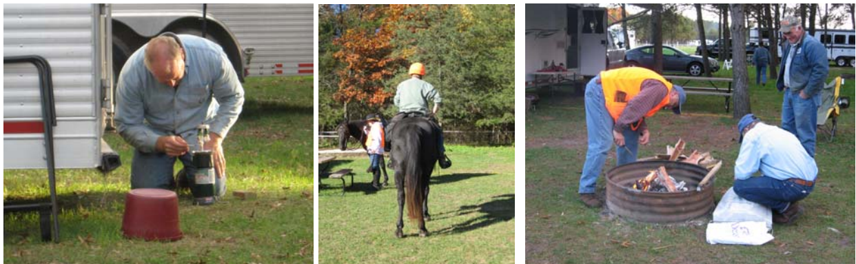
Ukarydee campground activity - - Do you recognize these horsemen??