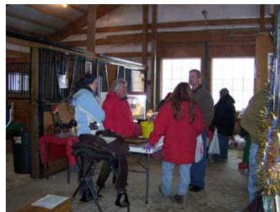
In addition to crafts, donated items and a silent auction, hot dogs, soda and popcorn were for sale.