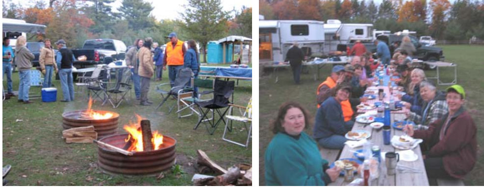
Gaiters' gathering at Ukarydee!