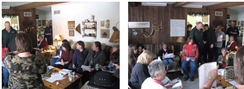
TGers planning the 2008 riding schedule