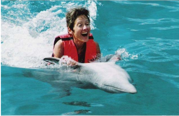
Swim / Dolphin @ Chankannab Park, Cozumel